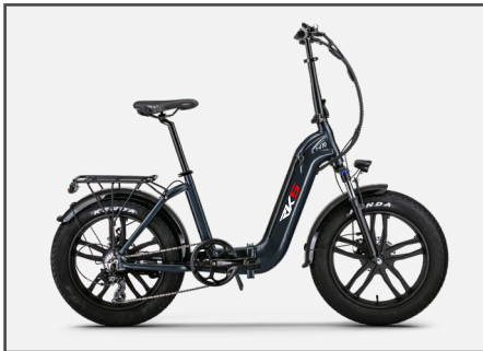
COLOUR CODE: YS9166 ANTHRACITE GRAY