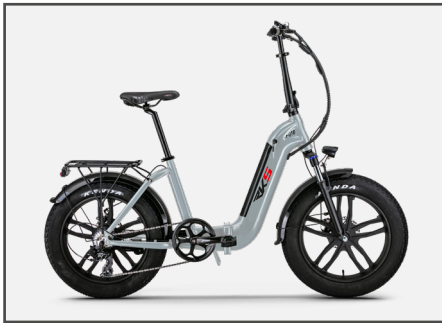
COLOUR CODE: R1 NARDO GRAY